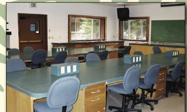
Art McKee Teaching Laboratory