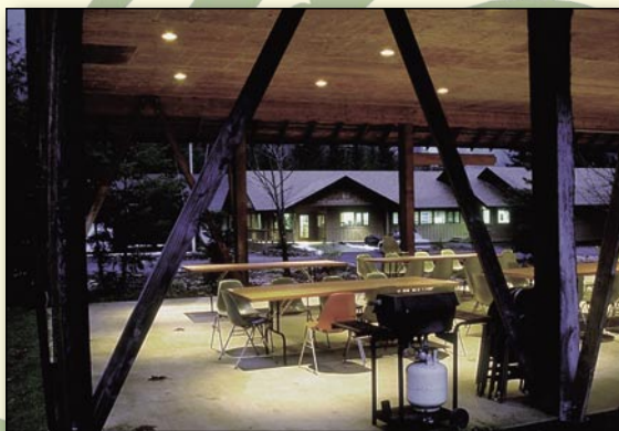
Salt Salmon Pavilion

The U.S. Department of Agriculture (USDA) prohibits discrimination in all its programs and activities on the basis of race, color, national origin, gender, religion, age, disability, political beliefs, sexual orientation, or marital or family status. (Not all prohibited bases apply to all programs.) Persons with disabilities who require alternative means for communication of program information (Braille, large print, audiotape, etc.) should contact USDA's TARGET Center at (202) 720-2600 (voice and TDD). To file a complaint of discrimination, write USDA, Director, Office of Civil Rights, Room 326-W, Whitten Building, 14 th and Independence Avenue, SW, Washington, DC 20250-9410 or call (202) 720-5964 (voice and TDD). USDA is an equal opportunity provider and employer.