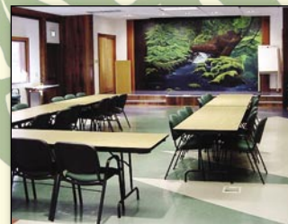
Conference/ lecture hall