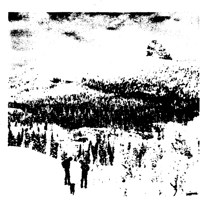
Figure 2 —Winter landscape in the subalpine mountain hemlock zone, high Cascades of Oregon. In the middle distance is a stand representative of the continuous forest subzone; above this and to the right is an example of the parkland subzone.

2Stations in Alaska are near sea level. Mountain hemlock grows at higher elevations where