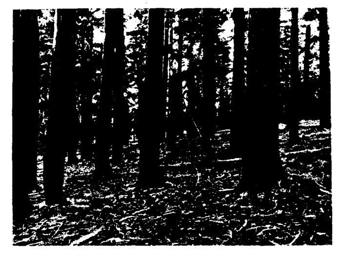
Figure 4—Well-stocked pure mountain hemlock stand in the central high Cascades of Oregon with canopy trees 300 to 400 years old.

The normally slow restocking process is retarded by slash treatment. On the east side of the Cascade Range in Oregon, treated (generally piled and burned) clearcuts had lower stocking (33 percent based on 0.0004-ha (0.001-acre) subplots) than untreated clearcuts (57 percent) because of destruction of advance regeneration and a 50-percent decrease in the number of subplots stocked with natural, postharvest reproduction (61). These clearcuts ranged from 3 to 19 years old. Stocking of mountain hemlock and its associates near Willamette Pass, OR, in 13-