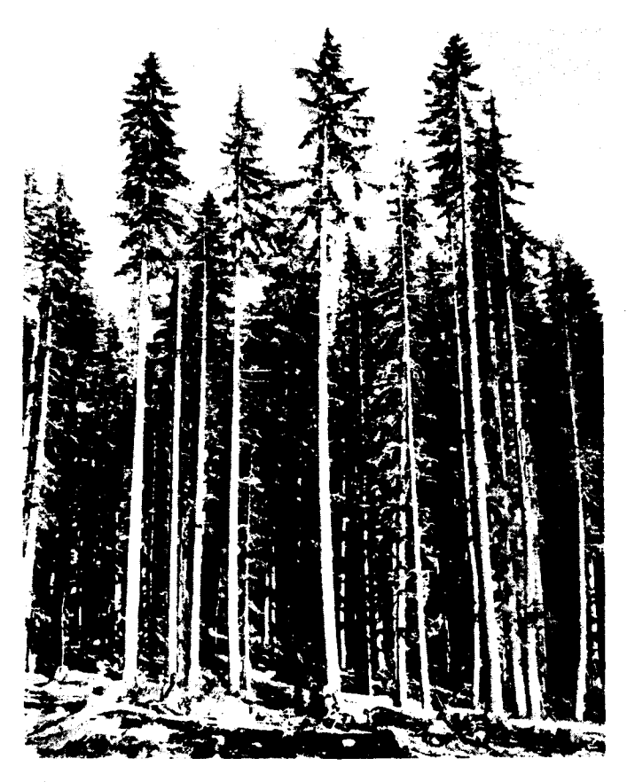
Figure 3 —Forest-grown mountain hemlock, showing good form, pruning, and height.

In Oregon, mountain hemlock forests typically regenerate slowly after they are clearcut. In a study of 25 clearcuts, 5 to 11 years were required to reach 60-percent stocking on 0.0012-ha (0.003-acre) subplots (56). Establishment of seedlings during the first 2 years in an Oregon shelterwood cut was very low because germinants were few at low residual basal areas (less than 11.5 m<sup>2</sup>/ha or 50 ft<sup>2</sup>/acre) and all seedlings died at all higher basal areas (69).