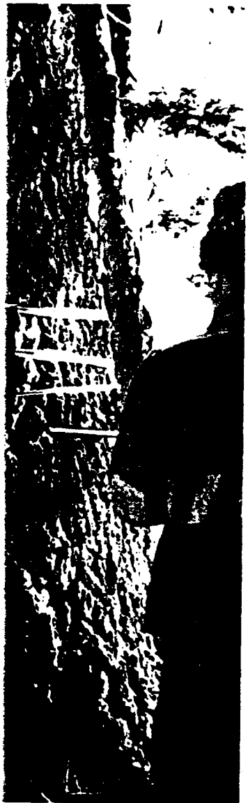
an old-growth grand fir marked

wilderness areas. Therefore, 10 are in either the Wenaha-... Each study area contains... information on stand char-... defoliation, and tree mortal-