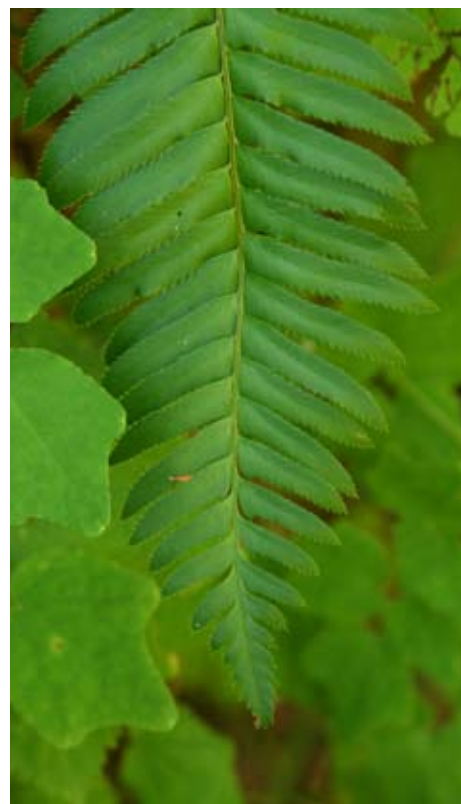
Understory vegetation at the Andrews Forest.