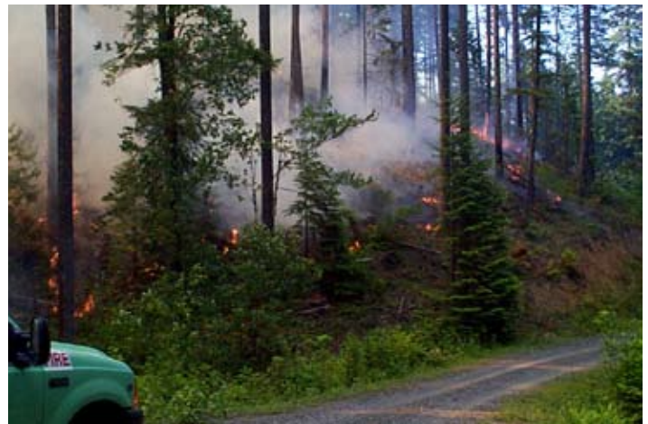
Prescribed light-severity fire in a recently thinned stand in the Blue River watershed.

The research-management partnership associated with Andrews Forest is exploring use of historical fire regimes as a general template for future vegetation management. This history-based approach may have advantages over the Northwest Forest Plan approach, particularly for species associated with late-successional forests. The Blue River Landscape Strategy (BRLS), developed by an interdisciplinary team of McKenzie River Ranger District employees and Andrews Forest scientists, was designed to explore this idea. Implementation of various aspects of the Strategy has been underway since the late 1990s, using an adaptive management process to assess new information, including results of monitoring, to plan further action. The team recently completed a two-year review of the plan and determined that a key issue was to emulate historic, moderate-severity fire in 40- to 120-year-old stands. The team prescribed fire and silvicultural techniques suitable for these objectives. These low- to moderate-severity fires generally clear the understory and kill a small fraction of overstory trees. General silvicultural prescriptions were developed by the team to represent these historic conditions. Details on the BRLS can be found at www.reo.gov/ecoshare/ccamp/index.shtml .