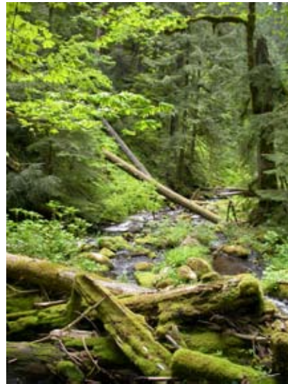
Mack Creek, which flows through old growth at the Andrews Forest. Since the early 1970s, Mack Creek has been the site of many stream and riparian studies, including LINX.