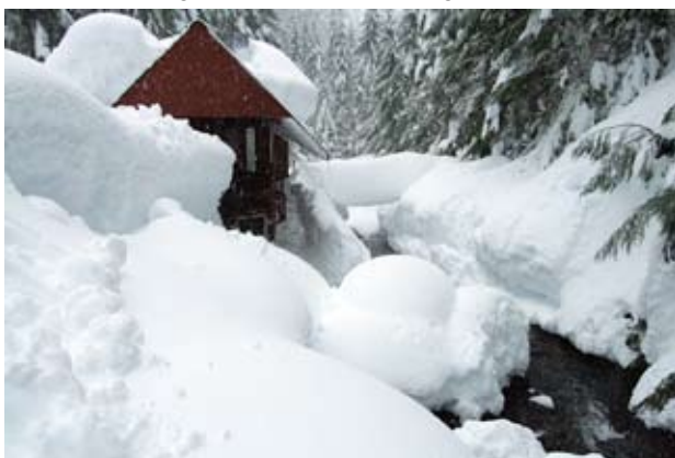
The Andrews Forest Mack Creek Gaging Station with a generous helping of fresh snow, February 2, 2008.