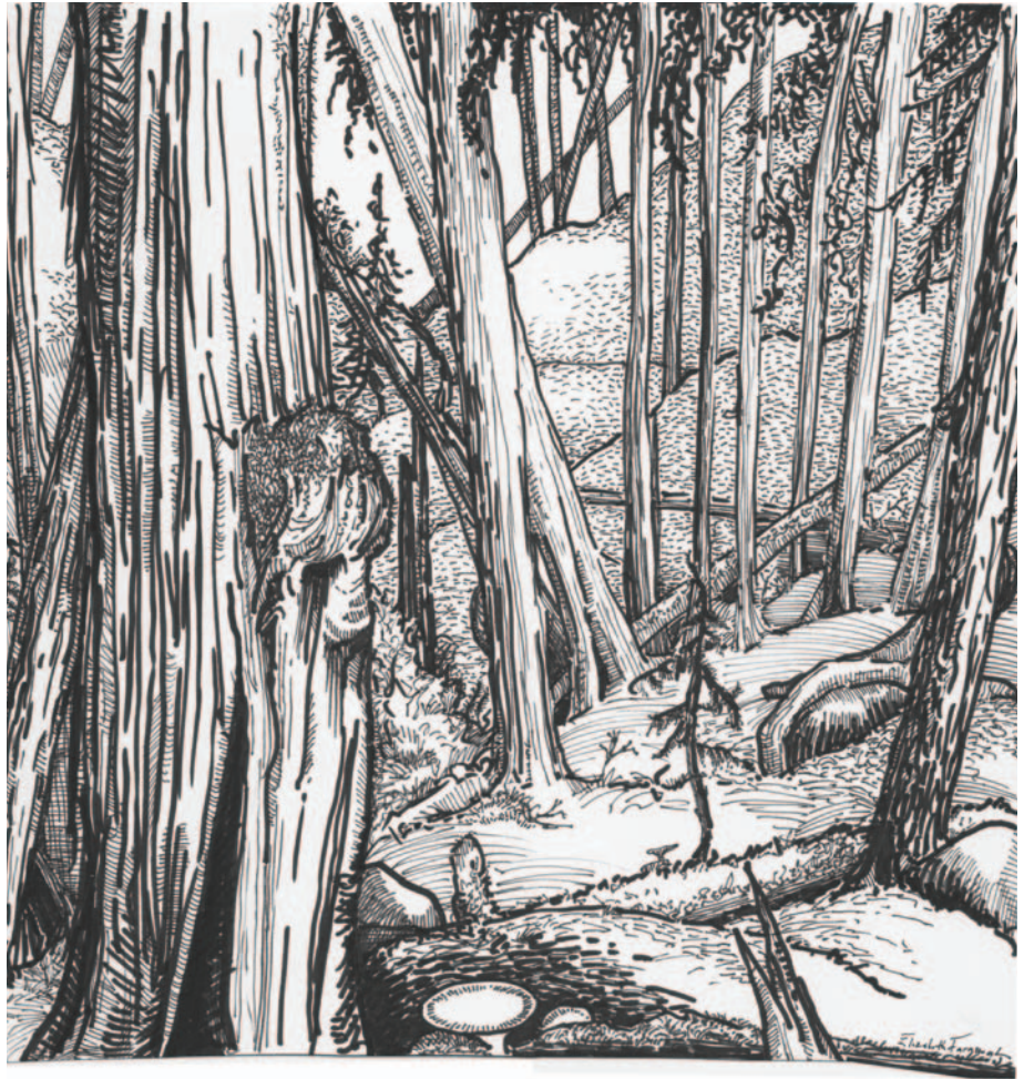
Figure 8 Elizabeth Farnsworth, Légerian Forest , pen & ink on paper, 11.5 × 11.5 in. (Collection of the author, and reproduced with permission of the artist).

from this world but leaving traces behind—fossils, middens, art—that will eventually decay into their component atoms that will be reborn and reused in new objects and new species.