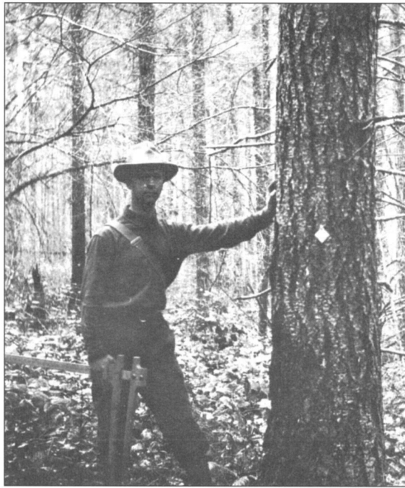
In the early days of the permanent study plot program, large calipers were used to measure tree diameter.

"Changes in the composition, structure, and functions of forest ecosystems typically occur over long periods of time. In the Pacific Northwest...for example, it is not unusual for individual dominant trees to survive for 500 years or longer," writes Steve Acker, formerly an Oregon State University forest researcher, in a book