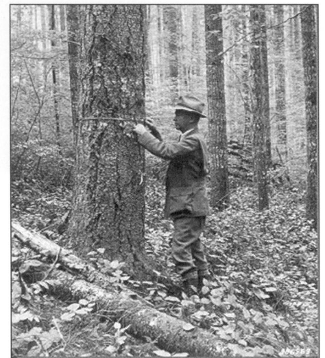
Thornton T. Munger held the vision behind the permanent study plot program, believing Western forests could not be managed without a growing base of longitudinal data.

“This analysis revealed that in order to measure late-successional and old-growth forest attributes in the Northwest within an acceptable level of accuracy, the national FIA plot size needed to be expanded for the measurement of live trees and snags.” Plot