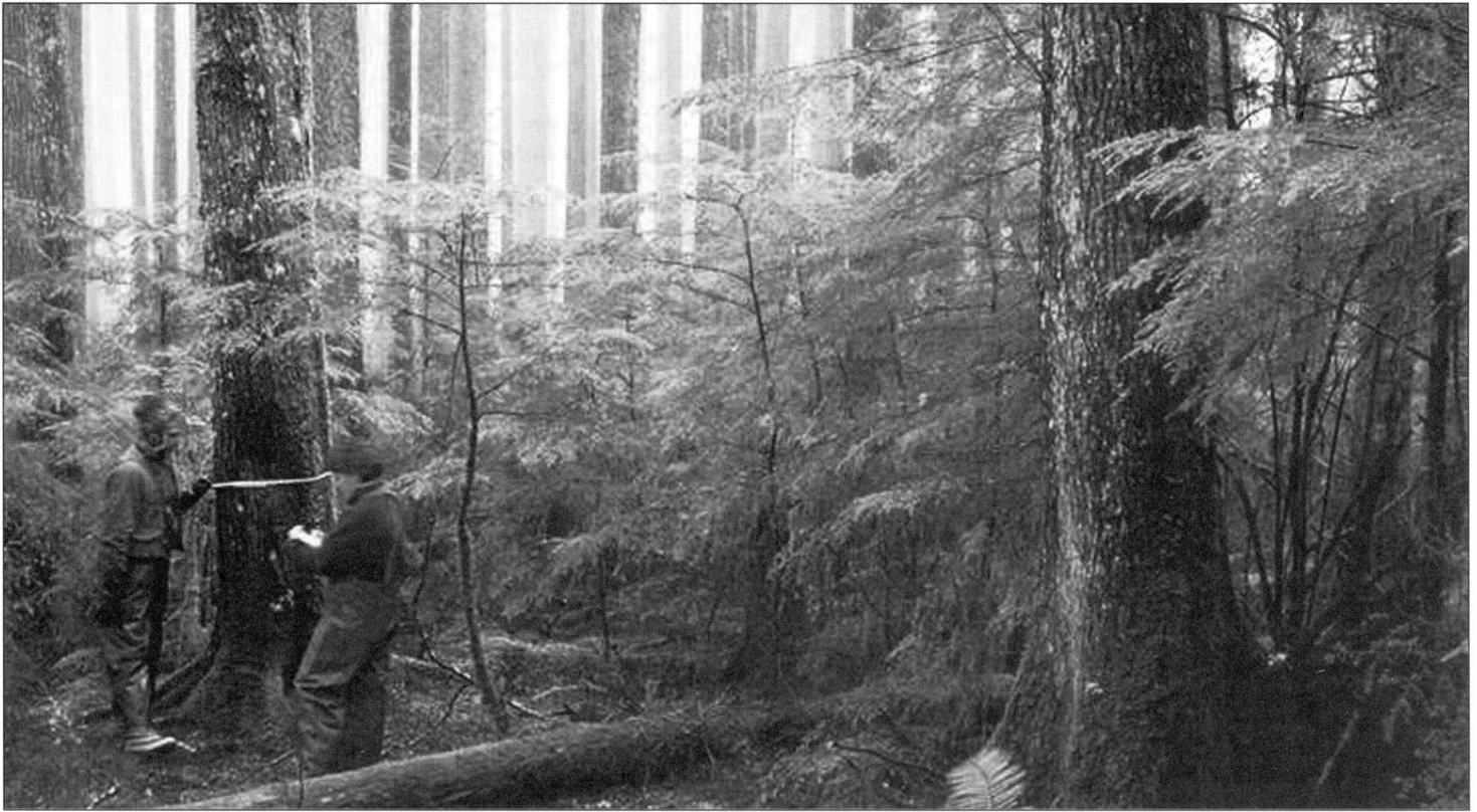
Measurements of permanent study plots continues today, with the 14 th measurement of the original plots completed in 2002.

opportunities for examination of this issue over the entire life cycle of PNW forests.” (A chronosequence study takes data from a single point in time in different-aged stands, rather than following a number of stands over a long period.)