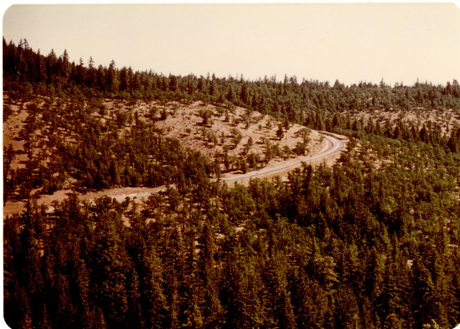
Figure 2. Examples of the Quga/Putr/Agsp c. t. in upper right center and the Pipo-Quga/Putr/Feid c. t. in the remainder of the photograph.

The Pipo-Quga/Putr/Feid community has Quercus garryana codominant to subdominant to Pinus ponderosa . The appearance is that of a closed forest rather than that of the open woodland appearance of the Quga/Putr/Agsp community type. Figure 2 shows the contrasting appearance of the two types.