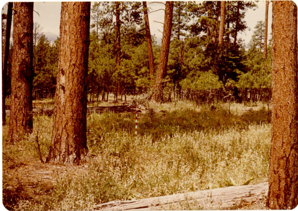
Figure 5. Photograph of plot number 35 showing a representative stand of the Pipo/Putr/Luca community. Note density of Lupinus caudatus and the clumped nature of the Pinus reproduction.

topography in areas of concave microrelief. Elevations are between 610 and 640 meters (Table 5). No soils data were collected. Field notes taken on plot number 35 indicated more rocks on the soil surface than were apparent in adjacent areas supporting the Pipo/Putr/Lule community.