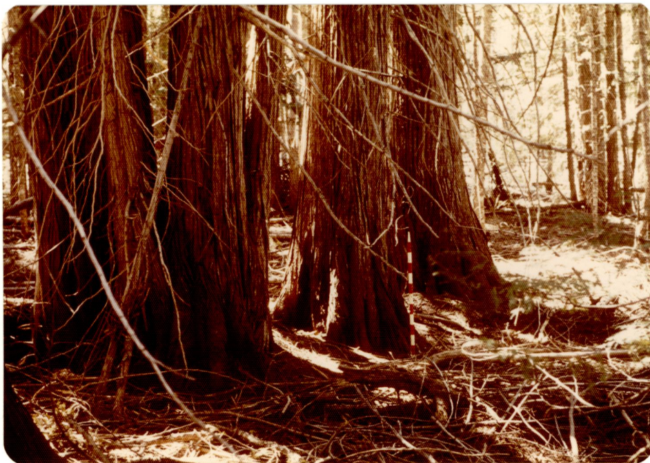
Figure 11. Photograph of plot number 89. Note the large size of the Thuja plicata trees and the depauperate understory evident in this heavily shaded stand within the Thpl/Libol c. t.

and Abies grandis and perhaps Picea engelmannii will be minor climax associates. Pseudotsuga menziesii , Larix occidentalis , and Populus trichocarpa all had coverage of five percent or more in at least one plot.