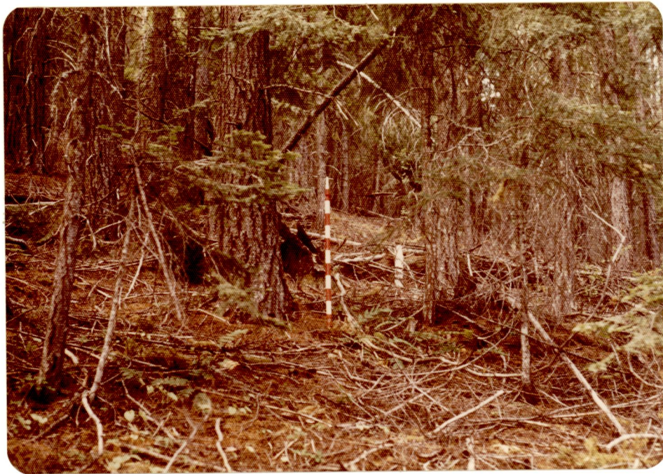
Figure 8. Photograph of plot number 95 showing a representative part of the Abgr / Pamy c.t. Abies grandis is dominant in all age classes.

grandis / Clintonia uniflora community of Pfister et al. (1974). The Abies grandis types described for the Rocky Mountains by the above authors, have more Clintonia uniflora , Vaccinium membranaceum and Linnaea borealis var. longiflora than do the stands representing the Abgr / Pamy community in the Badger Allotment. Hall's (1967) Abies grandis associations for the Ochocho Mountains also do not appear closely related.