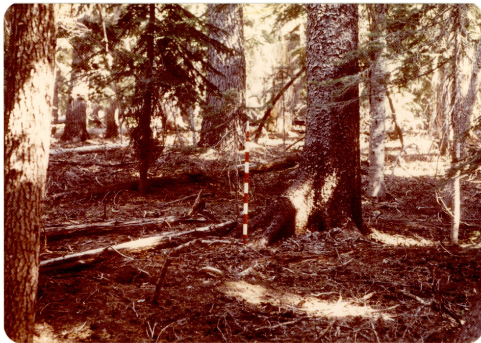
Figure 12. Photograph of plot number 141 showing a representative part of the Tshe/Libol c. t. Specimens of Picea engelmannii and Abies lasiocarpa are visible in the right center, but both the overstory and understory are dominated by Tsuga heterophylla .