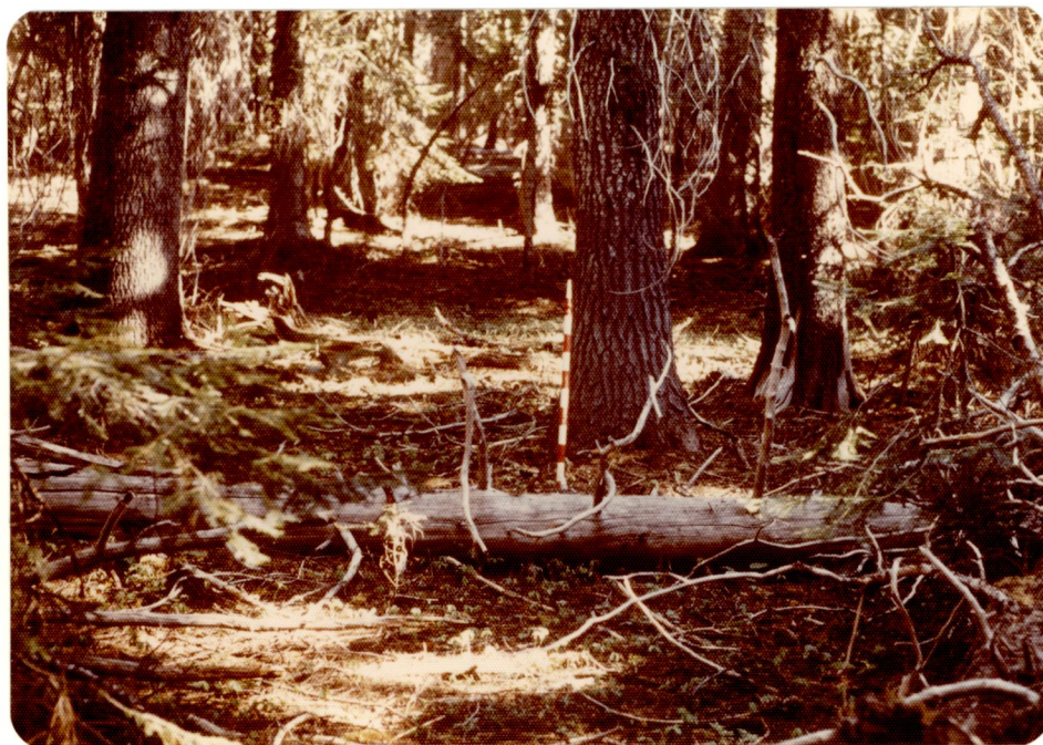
Figure 9. Photograph of plot number 154 showing a representative part of the Abgr/Pyse c. t., Abies grandis , A. lasiocarpa , Pinus monticola and P. contorta are all present but A. grandis dominates the reproduction.

Pseudotsuga menziesii , Pinus contorta , P. ponderosa , P. monticola and Picea engelmannii each have 70 percent or greater constancies (Appendix A). Abies procera , A. amabilis and Tsuga mertensiana are found occasionally in some stands representative of the type. Total tree crown cover is greater than on the Abgr/Pamy c. t. but total basal area is slightly lower (Table 4).