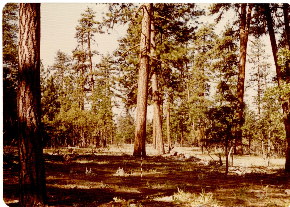
Figure 4. Photograph of plot number 22 showing a representative part of the Pipo/Putr/Lule c. t. Note the open nature of the stand and the subordinate stature of Quercus garryana . Other community types predominate the dense stands in the background.

(80-90+ cm) and less stoney (0-10%) than in the Quga/Putr/Agsp and Pipo-Quga/Putr/Feid community types (Table 5). The soils appear to be formed largely of "ash" with uniform fine sandy loam textures and weak subangular blocky structures.