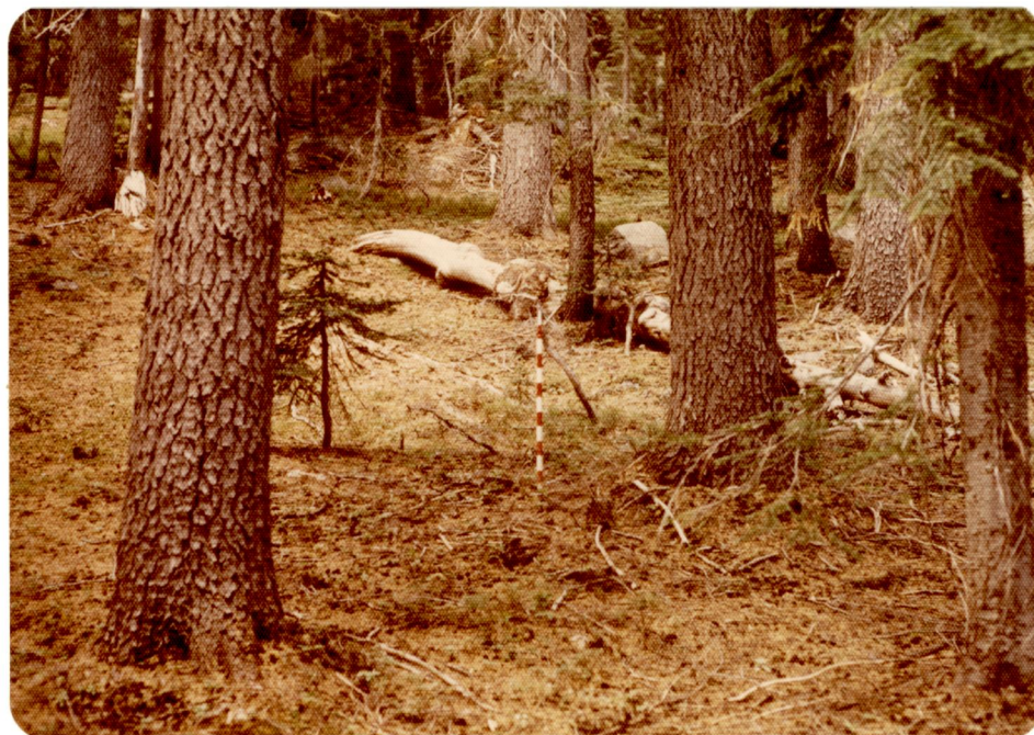
Figure 14. Photograph of plot number 190 showing a representative part of the Abam/Vasc community type. Tsuga mertensiana is the major overstory species but Abies amabilis dominates the understory.

Vaccinium scoparium usually dominates the understory but was absent from two of the 11 plots representative of the type, plots number 182 and 185. Four plots (numbers 182, 185, 184, and 199) were noted as having charred logs or other evidence of fire. Both of the plots lacking V. scoparium were in this category. Constancy of Vaccinium scoparium is 81 percent (Appendix A). Coverage averages five percent (Appendix B), although it exceeded 20 percent in two plots. Rubus lasiococcus is the only other shrub with more than 70 percent constancy (Appendix A).