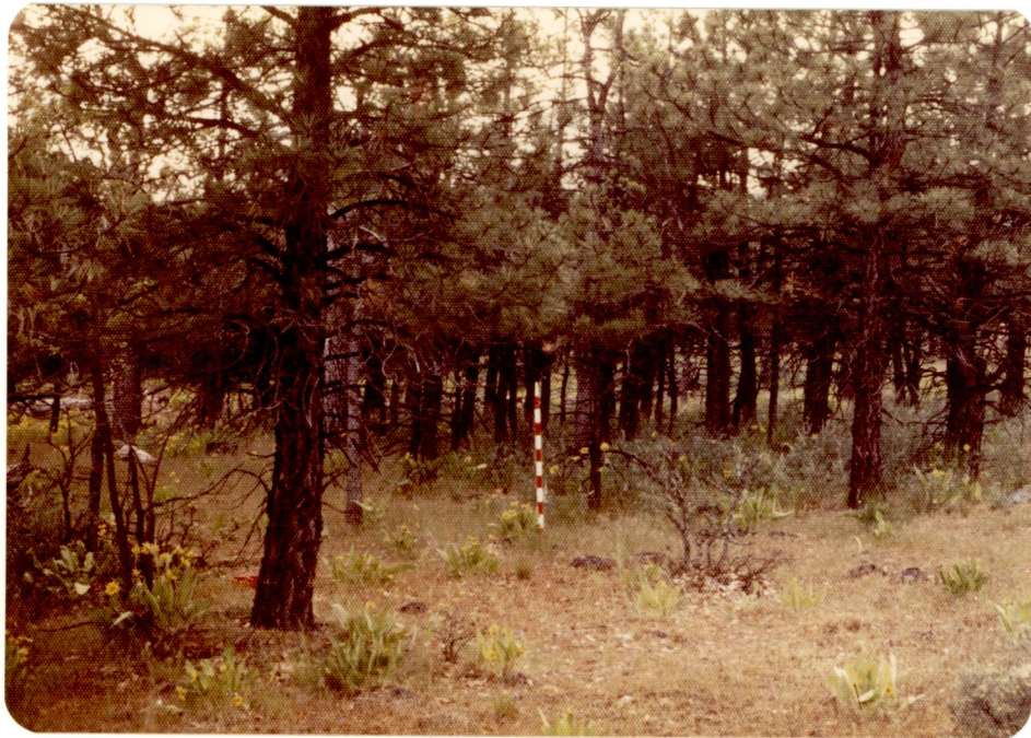
Figure 3. Photograph of plot number 5 showing a representative portion of the Pipo-Quga/P'utr/Feid c. t. Note the density of the stand and the stunted appearance of the trees.

by fire and disturbance, occasionally is abundant in stands that are lacking Purshia . This tends to support the theory that Purshia is the potential climax shrub on these areas but is temporarily absent because of fire or other disturbing factors.