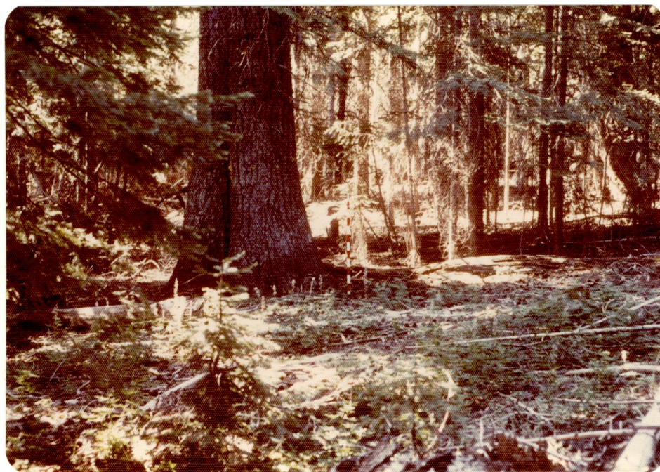
Figure 10. Photograph of plot number 119 showing a representative stand of the Abpr phase of the Abgr/Pyse c.t. A. procera dominates both overstory and understory.

little or no reproduction. Pinus monticola has the same average coverage values as P. contorta and Picea engelmannii (Table 3) but is present in only three-fourths of the plots (Appendix A). Abies lasiocarpa inexplicably shows 50 percent constancy and low average coverages; values that are considerably less than the Abgr/Pyse c.t. (Table 3). Pinus ponderosa is almost absent, apparently snowpack and low temperatures have exceeded the ecological limits of this species.