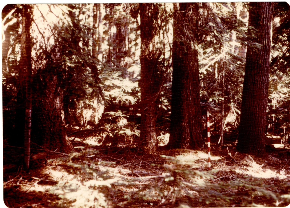
Figure 6. Photograph of plot number 108 representative of a relatively dense stand on the Agbr/Cage c.t. Abies grandis dominates all age classes. Note the lack of understory vegetation.