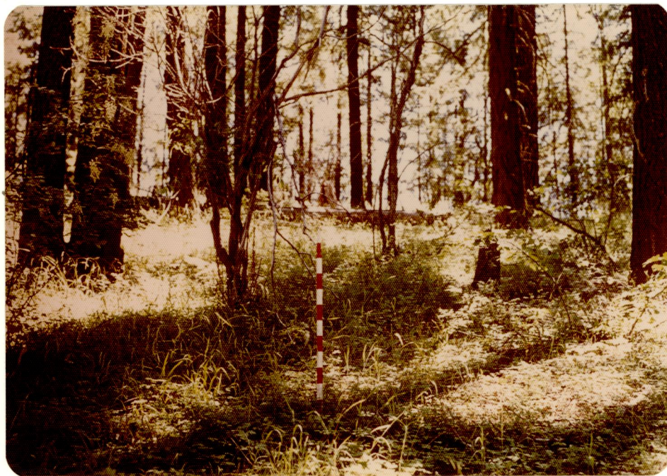
Figure 7. Photograph of plot number 58 a representative part of the Abgr/Cage c.t. which was selection cut a few years prior to being photographed. Contrast the understory development with that in Figure 6.