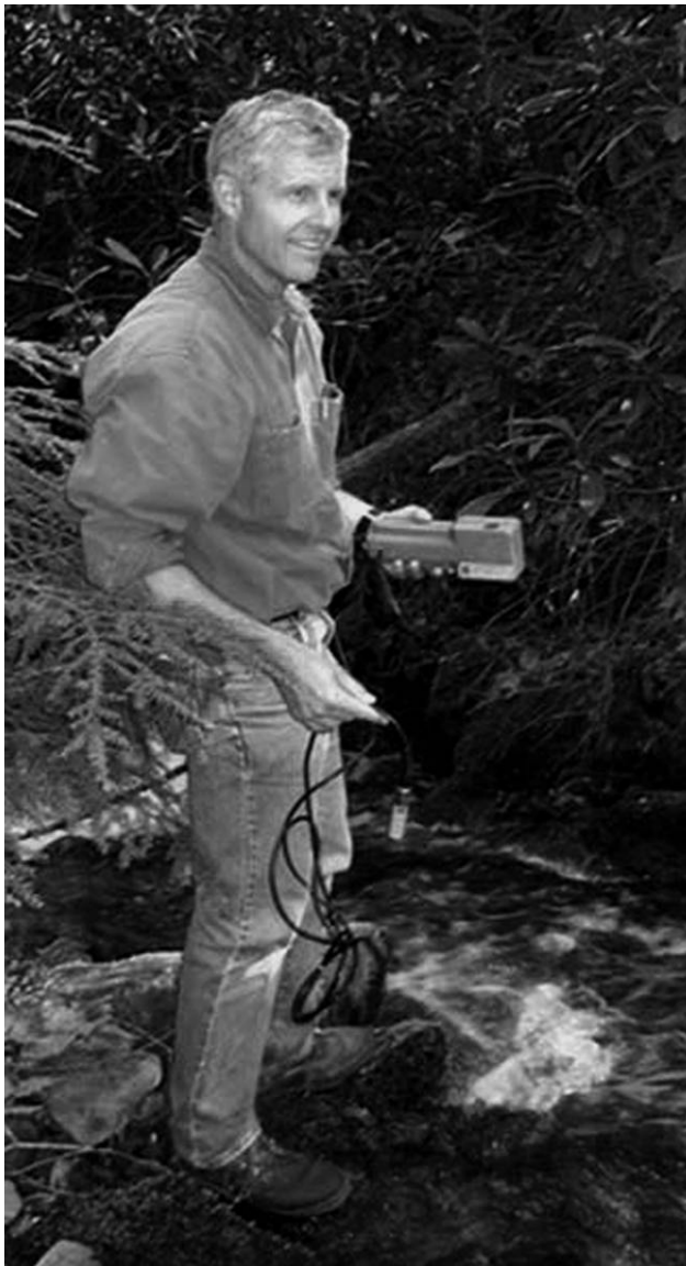
Figure 1. Patrick J. Mulholland (1952–2012), leader of the Lotic Intersite Nitrogen eXperiments (LINX).

physical data set (Zhang et al. 1999, Hubbard et al. 2013) through collaboration across the disciplines of hydrology, ecology, geography, and modeling. Collaboration between ecophysicists and hydrologists addressed the fate of water use by vegetation (Brooks et al. 2009). A large cross-continent experiment on terrestrial nutrient enrichment (NUTNET) has provided broad and general results (Borer et al. 2014). Like LINX, these studies were able to address large-scale scientific questions by applying disciplinary expertise to interdisciplinary problems through focused collaborative effort.