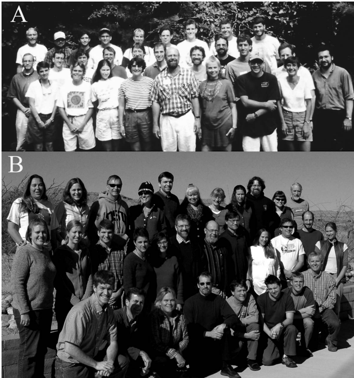
Figure 3. A.—Preliminary group of collaborators at Coweeta Hydrologic Laboratory in 1995 that led to formation of the LINX I group. B.—Lotic Intersite Nitrogen eXperiments (LINX) II collaborators at a synthesis workshop at the Sevilleta long-term ecological research site (LTER) near the end of the experiment in November 2006.

proach, which included whole-stream ^{15}\text{N} -tracer experiments bolstered by other ecosystem measurements, a cross-site comparative design, and integration of modeling and empirical approaches, also added to its appeal.