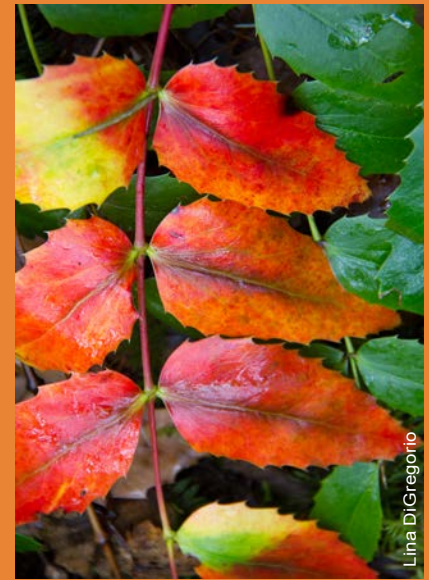
Fall color in Oregon grape ( Mahonia aquifolia ) at the Andrews Forest.