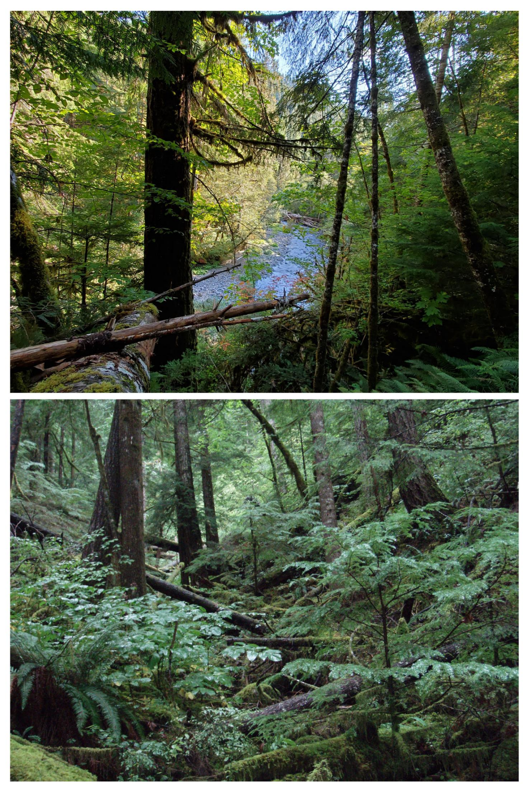
Figure 2 in Johnson et al. 2021. (a) Photo of Lookout Creek near the USGS gaging station. (b) Photo of headwater stream under dense vegetation.