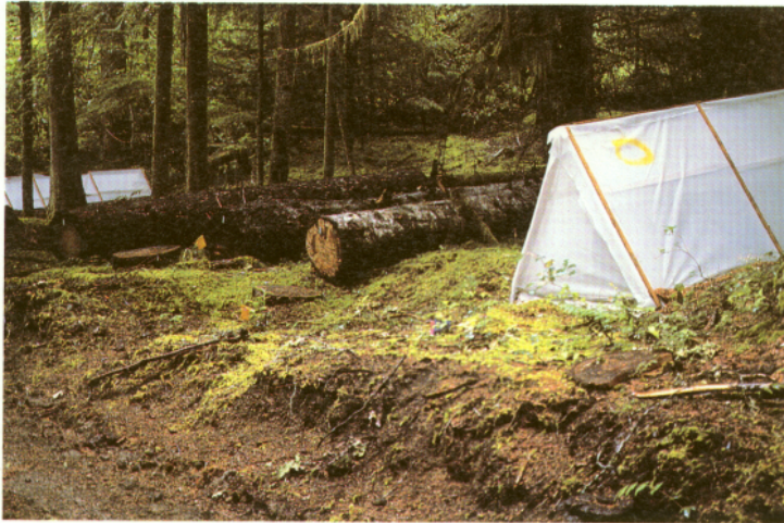
Figure 5.3—An experimental study of log decomposition planned to span a 200-year period has been installed at the H.J. Andrews Experimental Forest in the central Oregon Cascade Range; major variables include species, size, and presence or absence (log enclosed in insect-proof tent) of invertebrates during early stages of decomposition.

The challenge to managers of public forest lands is to maintain ecological diversity in perpetuity. We must understand and accept biological complexity. We must follow the basic principle of maintaining or restoring genetic, structural, and spatial complexity.