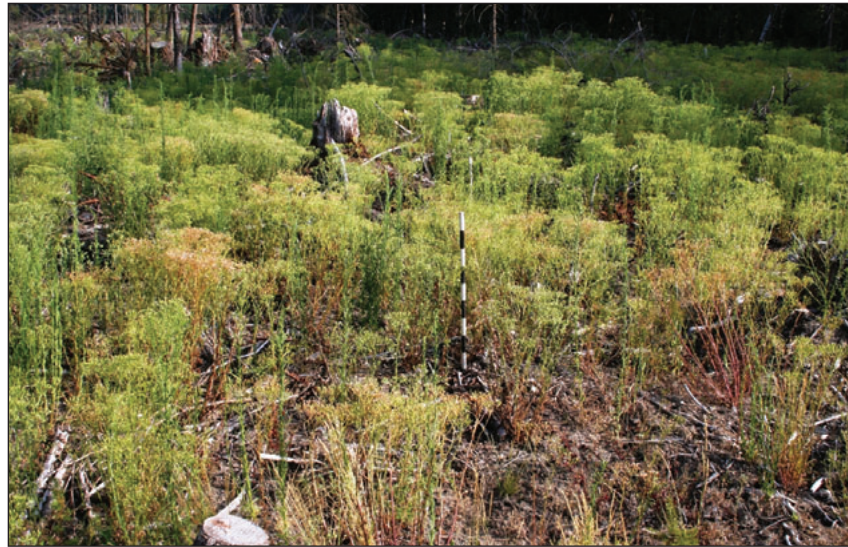
Figure 4. Early-successional communities are often dominated by annual herbaceous species for the first few years after disturbance; these are quickly displaced by perennial herbaceous species and shrubs.

Small mammal communities in ESFEs typically show high levels of diversity as well, including some obvious habitat specialists. The eastern chestnut mouse ( Pseudomys gracilicaudatus ), for example, inhabits early-successional environments in coastal eastern Australia for 2–5 years after a wildfire, and then declines dramatically until these environments are burned again (Fox 1990). Populations of mesopredators (medium-sized predators, such as raccoons [ Procyon lotor ] and fox species) benefit from the abundance of small vertebrate prey items characteristic of ESFEs. Likewise, some species