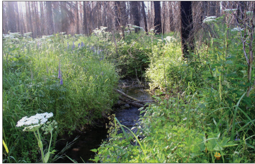
Figure 6. Streams within early-successional forest ecosystems contrast with forest-dominated reaches in many ecosystem attributes, including physical parameters (temperature and insolation), structure, plant and animal composition, and ecosystem processes, such as primary productivity.

Prompt, dense reforestation can have negative conse-