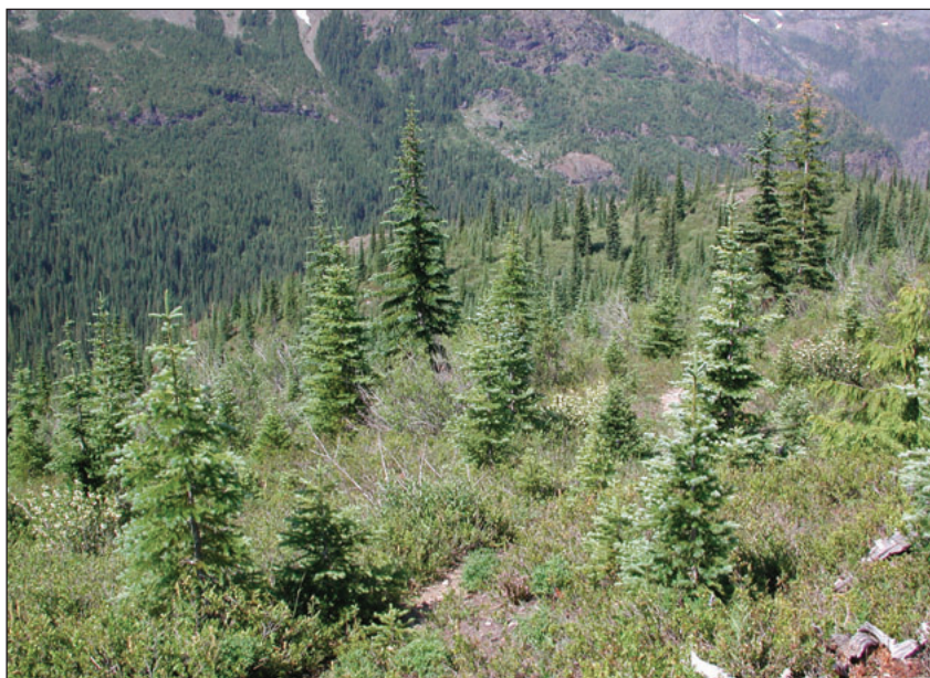
Figure 1. Stand-replacement disturbance events in forests create large areas free of tree dominance and rich in physical and biological resources, including legacies of the pre-disturbance ecosystem.