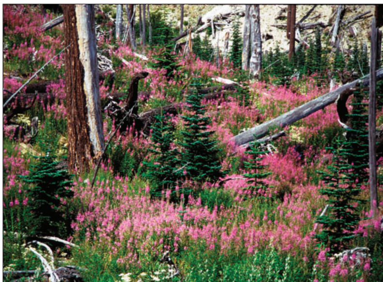
Figure 3. Plant communities with well-developed shrub and perennial herb species are characteristic of early-successional communities on forest sites and provide diverse food resources. Twenty-five years after the Mount St Helens eruption in 1980, this community, which was within the blast zone, includes well-developed shrubs (eg Sorbus and Vaccinium spp), trees, and perennial herbs (eg Epilobium angustifolium ).

Structural complexity is further enhanced by the establishment and development of a variety of plant species, which often include perennial herbs and shrubs characteristic of open environments, as well as individual trees (Figure 3). The diversity of plant morphologies (maximum height, crown width, etc) increases structural richness, so that this associated flora contributes to both horizontal and vertical heterogeneity.