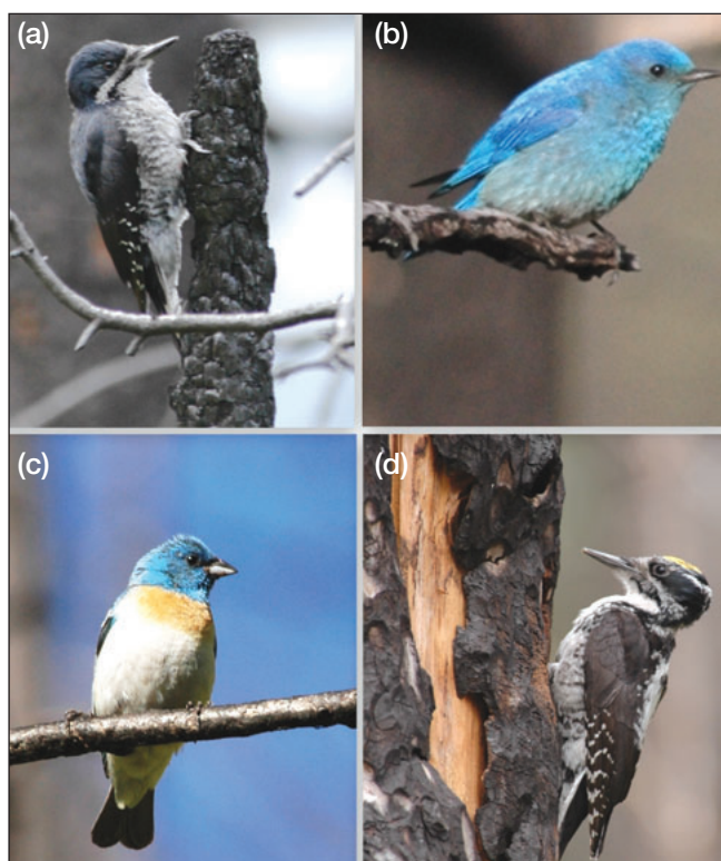
Figure 5. Bird diversity is typically high in early-successional communities on forest sites and includes many habitat specialists: (a) black-backed woodpeckers ( Picoides arcticus ) are almost entirely restricted to early post-fire habitat; (b) mountain bluebirds ( Sialia currucoides ) favor early-successional ecosystems; (c) lazuli buntings ( Passerina amoena ) and (d) three-toed woodpeckers ( Picoides tridactylus ) have similar requirements.

successional context (Minshall 2003; Figure 6). This greatly diversifies the types and timing of allochthonous inputs, as well as increases primary productivity. Allochthonous inputs are shifted from primarily tree-derived litter (coniferous-based in many systems) to material from a range of flowering herbs, shrubs, and trees, as well as from conifers. Consequently, litter inputs are highly variable in quality (eg decomposability) and delivery time, as compared with litter-fall contributed primarily by evergreen conifer species. Also, inputs to post-disturbance streams often include material with a high nitrogen content, such as litter from the early-successional genera Alnus and Ceanothus (Hibbs et al. 1994).