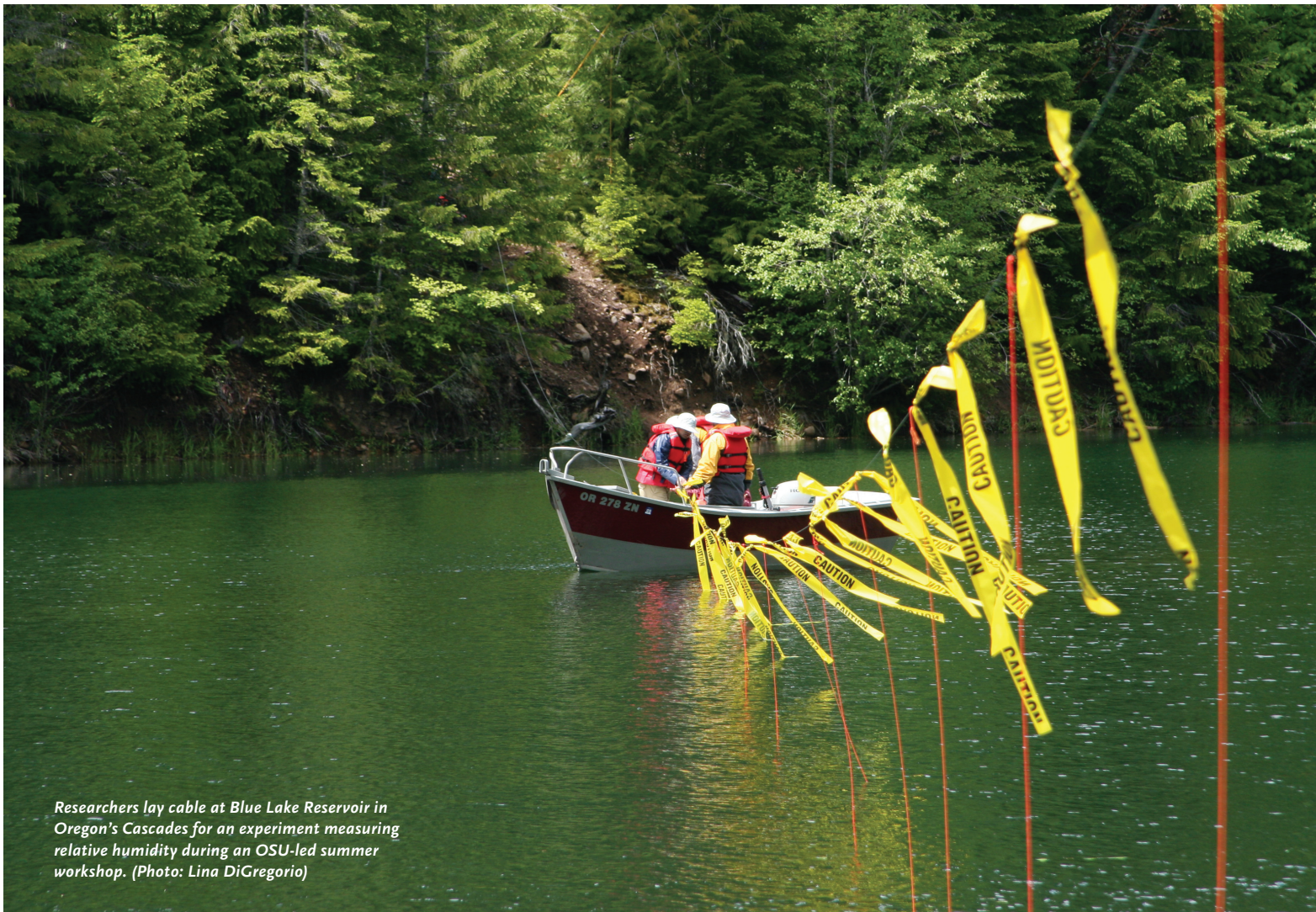
Researchers lay cable at Blue Lake Reservoir in Oregon's Cascades for an experiment measuring relative humidity during an OSU-led summer workshop.

whole lot of practical problems to be overcome,” Selker says. The sensors need to be carefully calibrated, for example, to correct for things like weld joints in the wires, “jitter” caused by stream flow and albedo (light reflection). “The history of science is littered with great measurement techniques that fizzled because of poorly run experiments,” says Selker. “We need to seed the science community with people who know how to do this.”