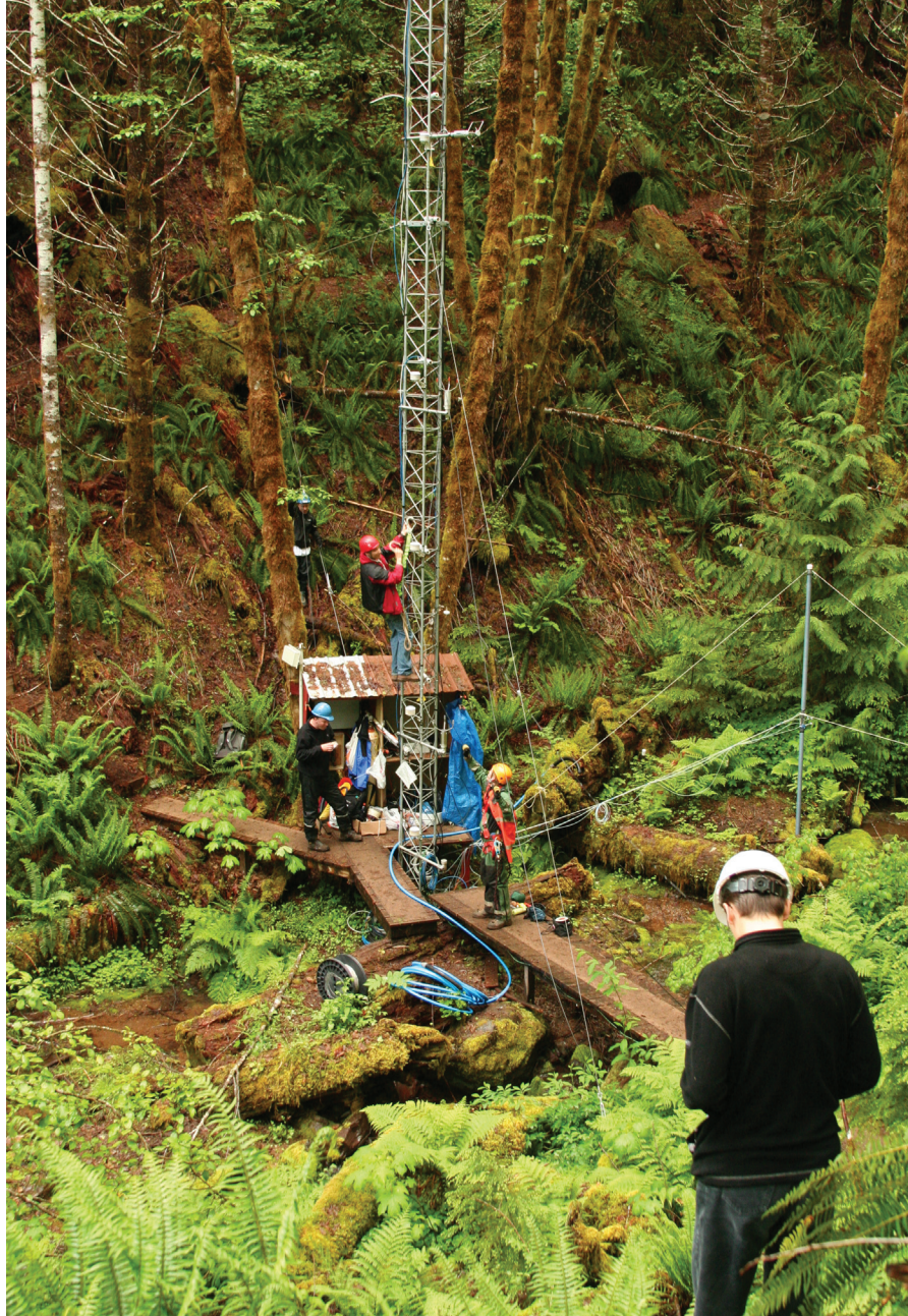
An international group of engineers, scientists and cable experts teams up in the H.J. Andrews Experimental Forest in June, stringing cable along a stream and, with the help of a potato canon from a 100-foot tower, threading it through the old-growth canopy.

Watch researchers deploy a fiberoptic network at the Andrews Forest, oregonstate.edu/terra