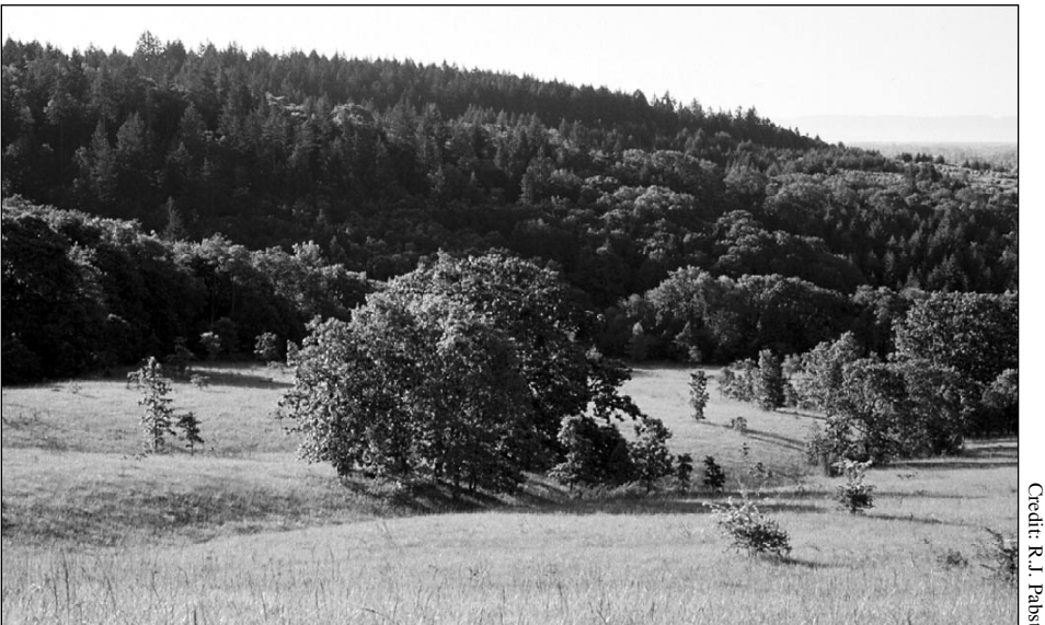
Foothill oak woodlands and hardwood trees are most abundant on private nonindustrial lands due to both environmental and past forest management effects. These forest types are unprotected by existing forest policies and land use laws.

"Improving prediction accuracy for some vegetation attributes may come at the cost of reduced accuracy for others, and it is possible to optimize the model for particular attributes," she says. In other words, one model