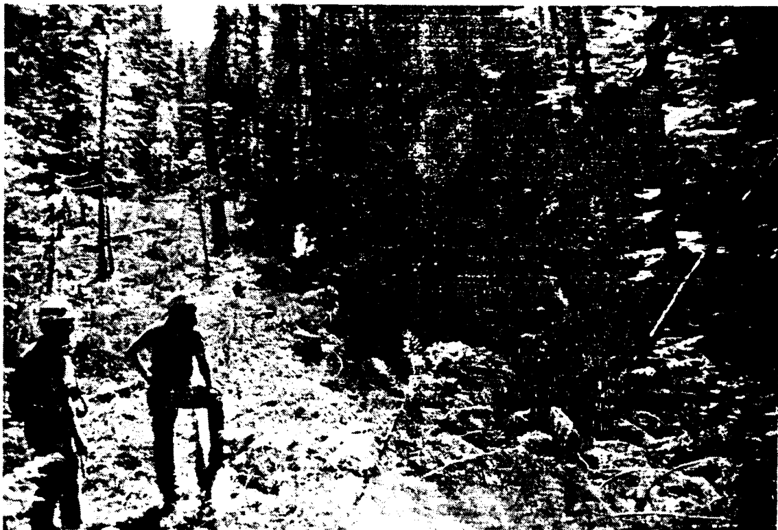
Figure 9 - The timber sale officer recognized this, spoke to people on the district to see how they felt about it, and they changed the prescription on the following unit. And this slide illustrates the buffer zone that was left when they changed the prescription to instead of an overstorey removal, to one which required leaving everything 30 feet either side of the stream. So we're getting the shade and the covering of the ground along the stream.

In conclusion, what have we learned? Harvest habits can be changed. If the home of the timber beast in Region 6 can change, others can change; other forests have changed. Just do it! It takes time, planning, and patience. I hope that what I've discussed will help you in your planning.