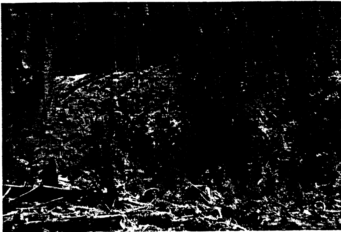
Figure 3 - Just another quick example of a unit where we have some green retention but not exactly what we would like to see. We're looking for more material.