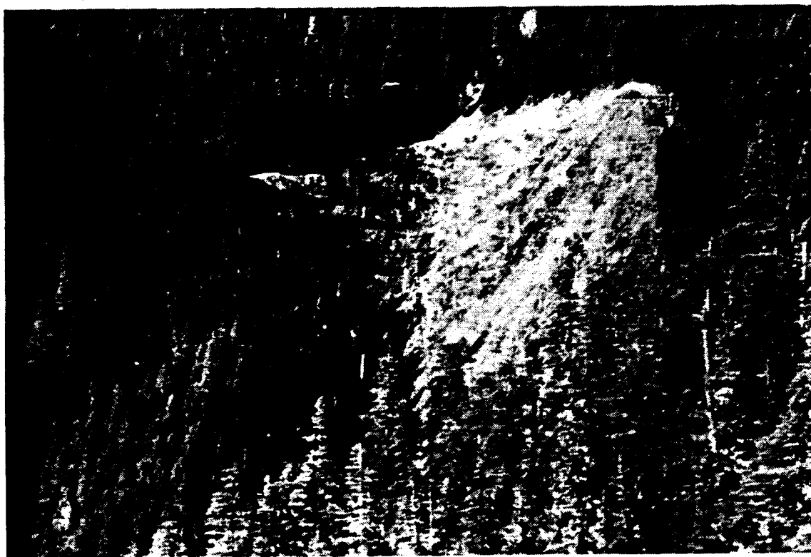
Figure 4 - This is an example of where you'd have a site specific prescription, the lay of the land will influence what you're doing. In the upper left-hand corner is a landing and you have