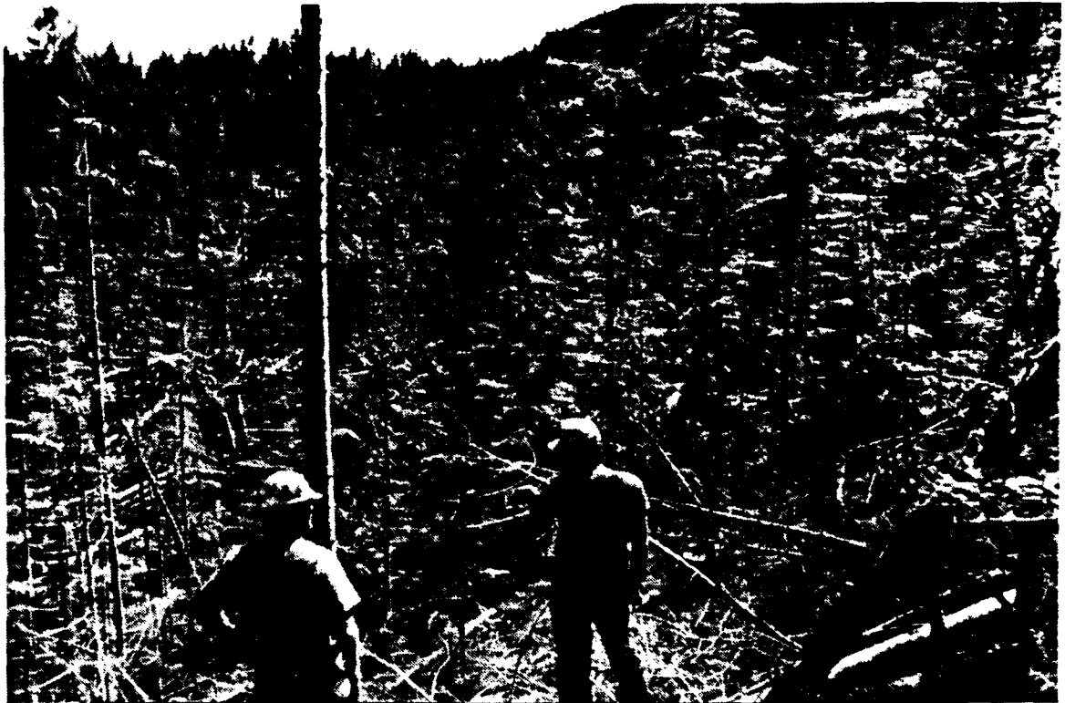
Figure 8 - Again, the same unit. This slide is to illustrate the response the timber sale officer made when he found an objective wasn't being met. There's a Class 3 stream that runs in through here. The prescription for that Class 3 was what we call an overstorey removal, 25 inches. The intention was to remove all the trees over 25 inches DBH, and then what was remaining would be providing shade and cover around that stream. What happened during the falling and the yarding was most of what was left in the understory was destroyed, and it looked pretty much like what we see up there. It was not what we'd wanted.