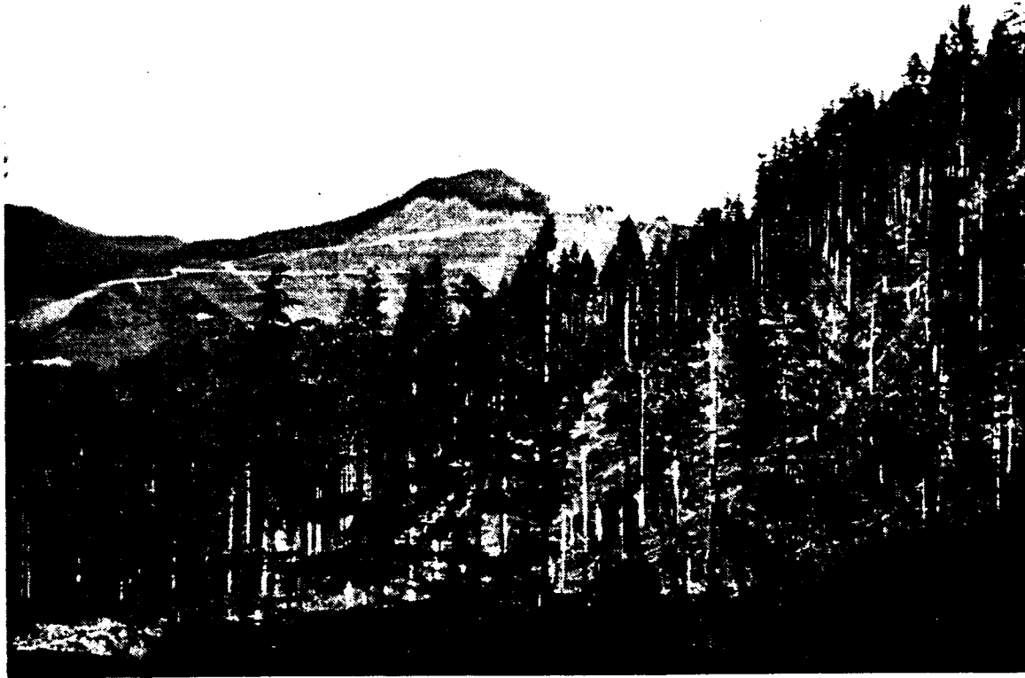
Figure 5 - This is a cable yarded unit. A number of years ago the timber sale contract required in most of our sales that all material be cut down to four inches. So we ended up with a fairly clean harvest unit afterwards; a few whips left, but not too much.

Down at the bottom of this unit where it's more logical to leave this green retention, that's where we have it. Initially, we wanted to have a uniform distribution of green retention trees, but that didn't always work because of safety and logging considerations. Now we have the trees clumped or, where possible, dispersed; this meets our objectives and it will meet the objectives of the loggers.