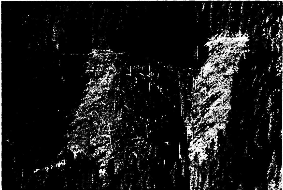
Figure 1 - This is a unit that is not achieving the levels of green tree/vertical structure that we'd like to see in one of our harvest units. We're going through a learning process, learning to walk before we run. This is the walking phase. You can see that we do have some snags left, and there's some green retention in the draw.

On the Blue River District and on the Willamette National Forest we're now writing what we call an integrated prescription. In the past, the specialists would write their own individual prescriptions. Now we put all of the information in a single document. In that way there's fewer conflicts; everyone knows what the others are doing. It's an interdisciplinary process.