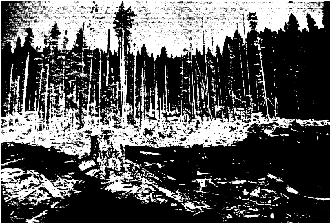
Figure 2 - This is one of our earlier attempts at leaving some vertical structure or green retention. And you can see in the background where the operator left some trees and what it would look like if we'd continue with our current practice of just yarding most of what we had. This unit was not burned, and the photo was taken this past summer. This unit has been planted and the stock is doing real well.

What we'd like to see in our units, of course, is more green retention throughout the unit where possible. And this draw today, if it were a Class 3 stream, we'd have a 30 to 50-foot buffer on either side of the stream.