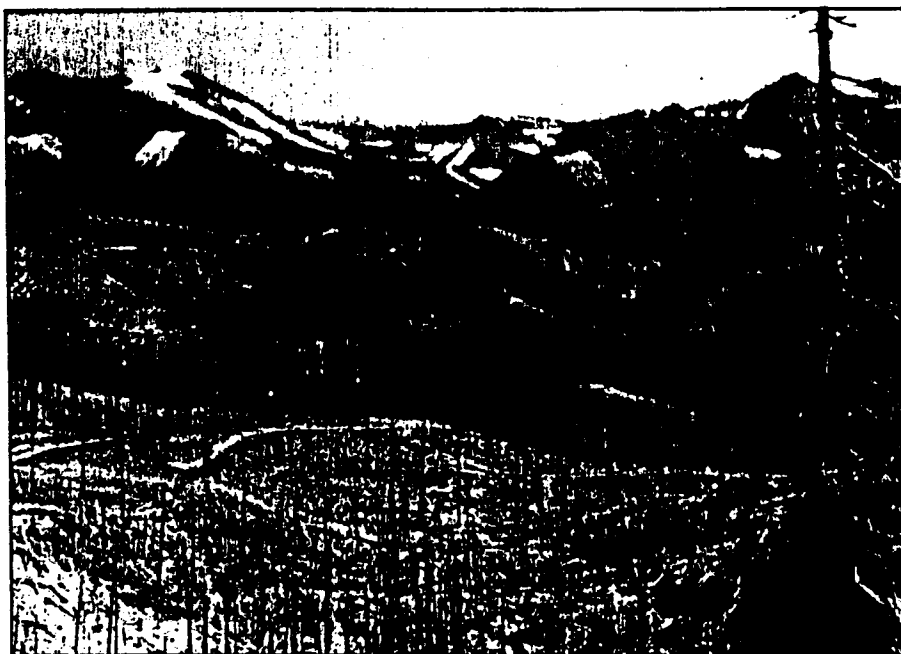
After a fire in the Willamette National Forest in Oregon, scientists and managers harvested some of the fire-killed trees and left patches and corridors of live green trees and standing and dead trees (foreground). The resulting forest is expected to contain more ecological structure and biotic diversity than the forests in the photos that follow.

The dissension about the spotted owl has been enough to make people start thinking about options in managing old-growth forests. In May,