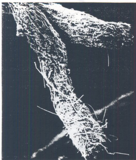
Fig. 4. Scanning electron micrograph of seedling root surface showing interaction with Hysterangium sechellii hyphae at a magnification of 40 \times .

Within these mats, Douglas-fir seedlings are physically linked to mature host trees via a seedling-ectomycorrhizal-mat-root connection (Figs. 4 and 5). Although a physical, but not physiological connection between the roots of the overstory Douglas fir and the seedlings was established, the fact that both of these root systems were within the same mat strongly suggests that they are physiologically linked as well. Further work to confirm a physiological link is needed.