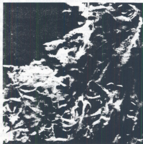
Fig. 1. Photograph of Hysterangium setchellii mat rhizomorphs colonizing Douglas-fir roots.

Ectomycorrhizal roots were bright white to grayish white underlain by a brown base (Fig. 2). Ectomycorrhizae were elongate to simply pin-