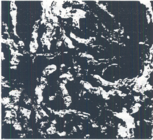
Fig. 2. Photograph of Douglas-fir roots colonized by Gautieria monticola .

nate, with length exceeding 7 mm and a diameter up to 1 mm. The mantle surface was woolly tomentose without rhizomorphs, but with some mycelial strands. Gautieria monticola also forms a profuse network of fungal material throughout the soil substrate. Colonized soil is hydrophobic nearly year round.