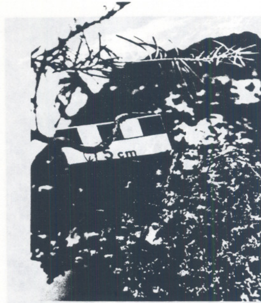
Fig. 3. Douglas-fir seedlings associated with a Hysterangium setchellii mat. The seedling is shown growing within soil extensively colonized by H. setchellii rhizomorphs.

In addition to the random belt transect observations, we also recorded the relationship between Douglas-fir seedlings and mat communities within a contiguous area of approximately 0.4 ha. Within this additional 0.4 ha sample, we found that all 45 Douglas-fir seedlings were associated with Gautieria monticola or Hysterangium setchellii mats with none found in rotten wood. We observed the same phenomenon in Douglas-fir seedlings in younger stands