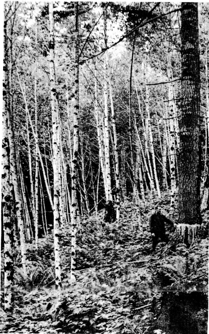
Figure 1. --All Douglas-fir overstory trees, with some up to 30 inches d. b. h., were girdled on the thinning study site; foreground was heavily thinned and background was unthinned.

When the study was established in 1937, all three sample stands were predominantly 21-year-old red alder. Two stands, however, contained a scattered overstory of 80-year-old Douglas-fir ( Pseudotsuga menziesii ) which was girdled at time of plot establishment (fig. 1). One of the released stands was then thinned to an approximate spacing of 12x12 feet and the other left unthinned. The third stand to be studied was pure red alder without an overstory; it was left in an untreated condition to develop as a natural stand. Major features of the stand treatments are outlined in table 1.