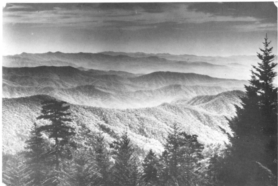
Fig. 3. Some established preserves which are outstanding representations of the biota of a region, such as Great Smoky Mountains National Park pictured here, have been established as biosphere reserves. These are designed to provide the large control area for experimental tracts with which they are matched and to serve as sites for the conservation of biotic diversity.

Some actions are required soon. Management plans for each of the biosphere reserves are important even if they only supplement comprehensive existing plans. These should particularly address the long-term objectives in biotic preservation, research and its support, monitoring and education, and the identification of major problems requiring managerial action or research. Emphasis should be on expanding scientific efforts in reserves with relatively small existing research programs. Emphasis in reserves with strong programs in research and experimentation should include adequate provision for strictly reserved natural areas for experimental controls and biotic preservation.