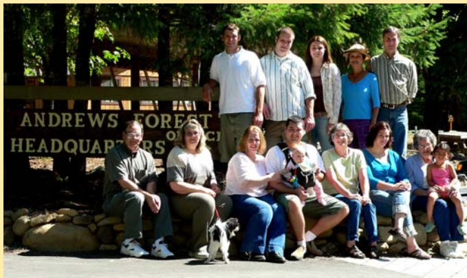
The Andrews family at the H.J. Andrews Experimental Forest in August 2005.

inventory of the region's forest resources in the 1930s has been used more recently to assess extent of old-growth forests and carbon stored in the public forest landscape before